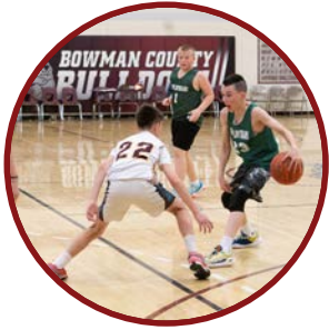
Bowman County Classic April 5 - 6, 2025