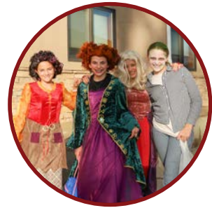
Trick or Treating on Main Street October 31, 2025