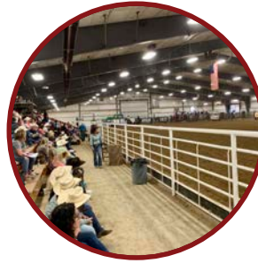
North Dakota High School Rodeo Finals June 11 - 15, 2025