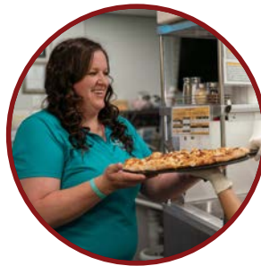
Gift Card Flash Sale November 12, 2025