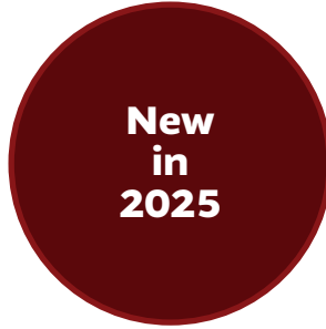
Around the World April 25, 2025