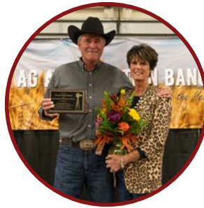
Ag Appreciation Banquet October 29, 2025