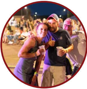
Rock the Block TBD