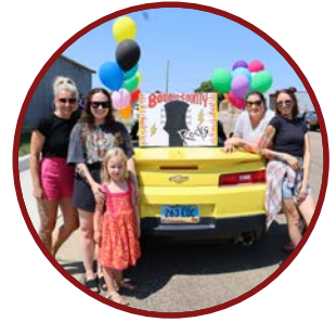
Bowman County Fair Parade July 13, 2025