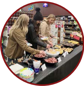
Ladies Night Out November 21, 2025