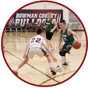
Bowman County Classic April 5 - 6, 2025