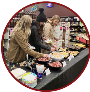
Ladies Night Out November 21, 2025