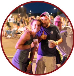
Rock the Block TBD