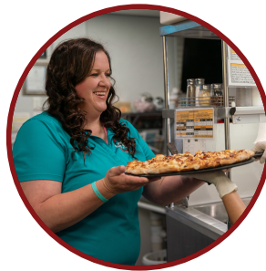
Gift Card Flash Sale November 12, 2025