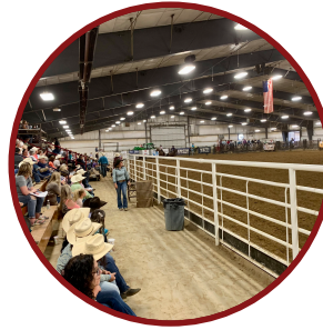
North Dakota High School Rodeo Finals June 11 - 15, 2025