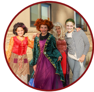
Trick or Treating on Main Street October 31, 2025