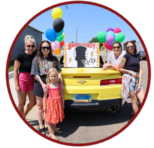
Bowman County Fair Parade July 13, 2025