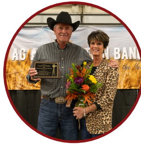
Ag Appreciation Banquet October 29, 2025