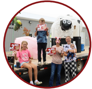
Bowman County Fair Parade July 14, 2024