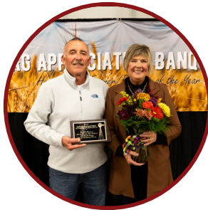
Ag Appreciation Banquet October 2024