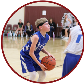
Bowman County Classic April 20-21, 2024