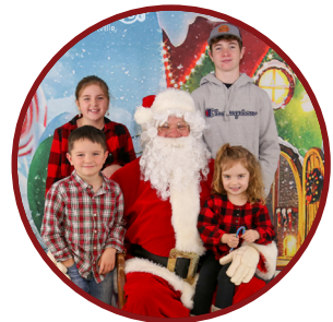
Christmas Promotions December 2024

Pre-Sponsor Events on Your 2024 Invoice!