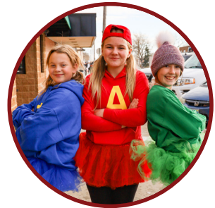
Trick or Treating on Main Street October 31, 2024