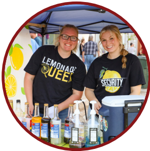
Rock the Block July 27, 2024