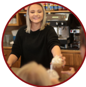
Gift Card Flash Sale December 3, 2024