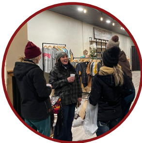
Ladies Night Out November 15, 2024