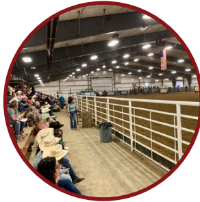
North Dakota High School Rodeo Finals June 12 - 16, 2024