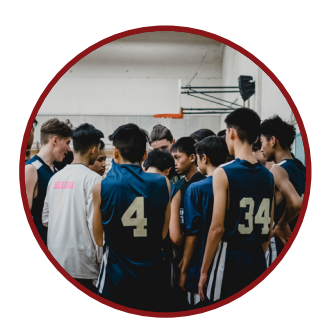
Bowman County Classic April 15 -16, 2023