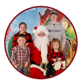
Santa Day TBD, 2023

Pre-Sponsor Events on Your 2023 Invoice!