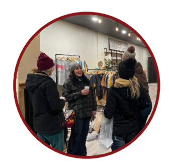
Ladies Night Out November 17, 2023