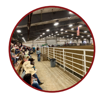
North Dakota High School Rodeo Finals June 7, 2023