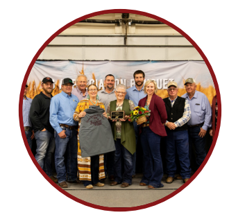
Ag Appreciation Banquet October 25, 2023